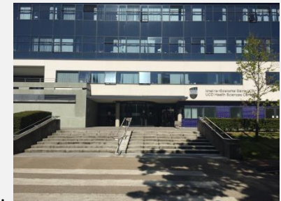
Entrance to UCD Health Sciences Building