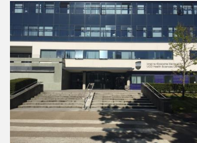
Entrance to UCD Health Sciences Building