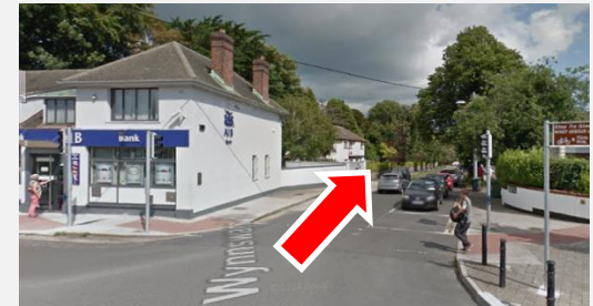
Clonskeagh Entrance – Wynnsward Drive